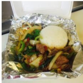
P5: Pad Bai Kra Pow