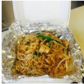
P1: Pad Thai

All prices include Missouri State sales tax of 8.225%.