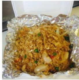
P2: Fried Rice