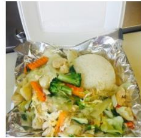
P4: Pad Woo Sen