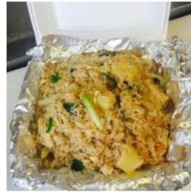
P3: Pineapple Fried Rice